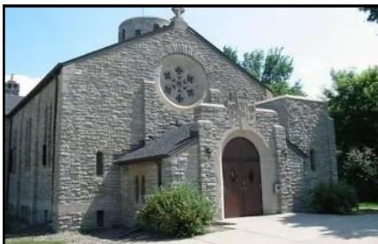
Fort Snelling Memorial Chapel

All LGAR members, family, and friends are welcome to register for the National Convention using the registration form in this Bugle Call. Tours of the Fort and grounds as well as access to nearby Mall of America are available for those not attending the members-only sessions. All are welcome without registration to the Memorial Service.